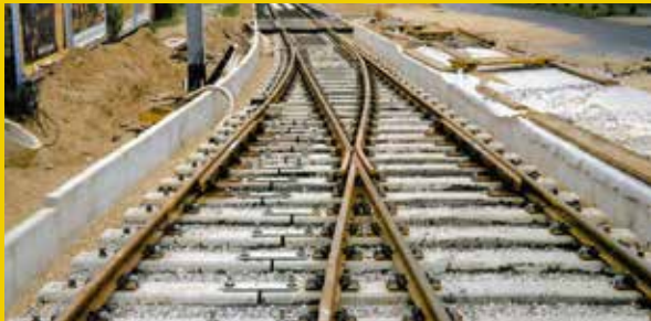
Decades of successful partnership: We have supplied our RHEDA CITY ballastless track system to Dresden's municipal transit authority since 1996 and to Berlin's since 1998.

TODAY'S URBAN TRANSIT IS ALL ABOUT ENVIRON- MENTAL AWARENESS AND SUSTAINABILITY – AND SO ARE WE!